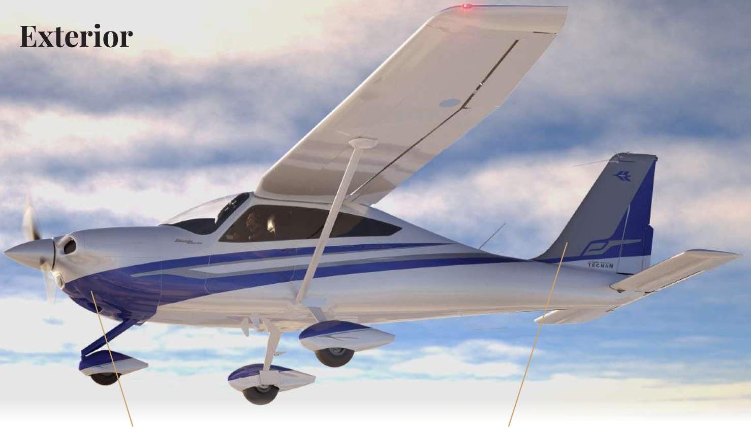
Metallic paint 1